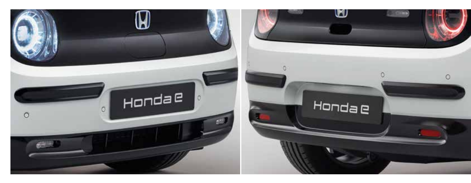
FRONT AND REAR BU

These Doorstep Garnishes add a personal touch to your car. Crafted in shiny black aluminium, they also feature an eye-catching Honda e logo. Set includes: Front and Rear Trims.